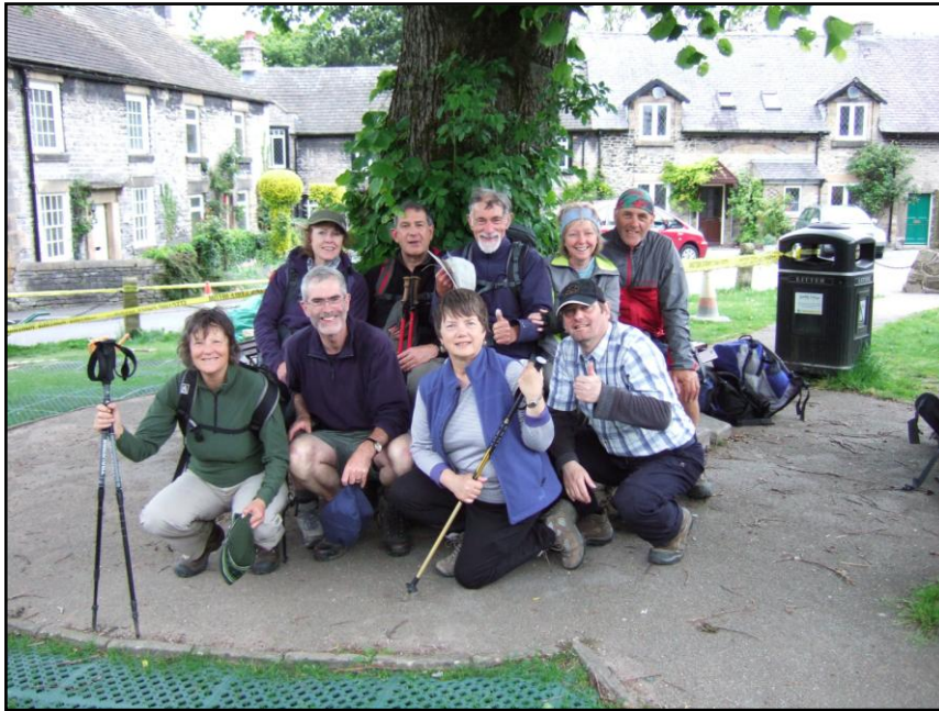
The finish at Castleton